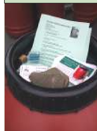
Rain barrel and SKC literature complete with a natural paper weight.

the Scott Key Center for the past six years. Stream-Link Education's (continued on pg. 4)