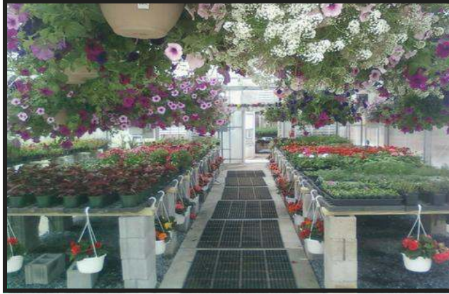
Pre-Mothers Day Sale look from inside the new greenhouse.

collecting rainwater through a screened intake. Rainwater fills the barrels, which are equipped with a six foot overflow hose and a brass bulkhead spout for garden hose hook-up.