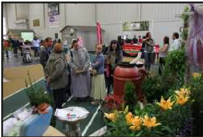
Garden enthusiasts line up for Hagerstown Community College's annual event.

Vendors and participants ranged in everything from nurseries and florists to outdoor furniture suppliers and pool services. This year, the SKC set up a beautiful arrangement of flowers, plants and herbs all grown at the SKC's greenhouse. The center also displayed one of our rain barrels, demonstrating to audiences how a rainwater collection system works. Garden enthusiasts from surrounding Washington and Frederick counties came to enjoy the show's seminars, demonstrations, raffles, food and fun. Overall, it was a great turnout this year!