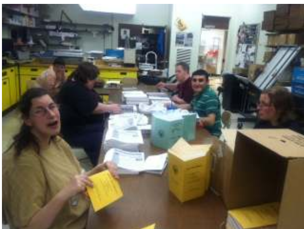
Members of production crew 6 are folding pamphlets for the University of Maryland Extension Service and the Frederick County Environmental Health Division.

There are seven production crews here at Scott Key Center. They perform a variety of jobs including bulk mailing services, paper shredding services, the cutting and labeling of deck samples, greenhouse maintenance, the assembly of screw kits, gaskets, & mulling spice, and